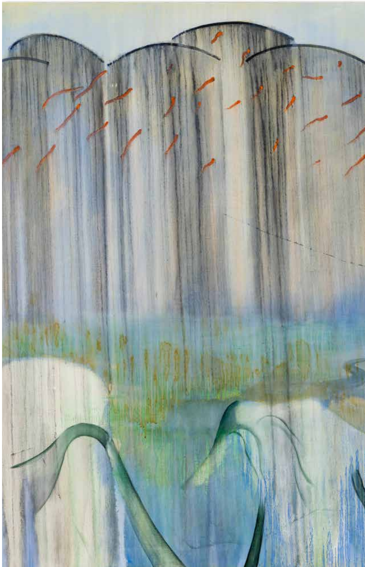
Force (Landscape) 2022