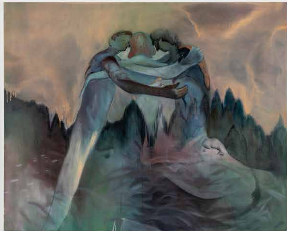
Field (峠 Tōge) 2022