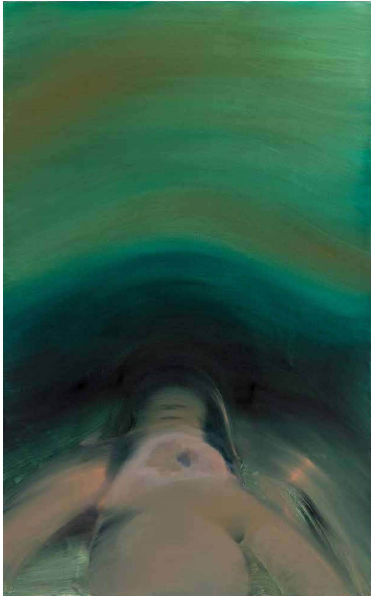
Field (Body) 2022