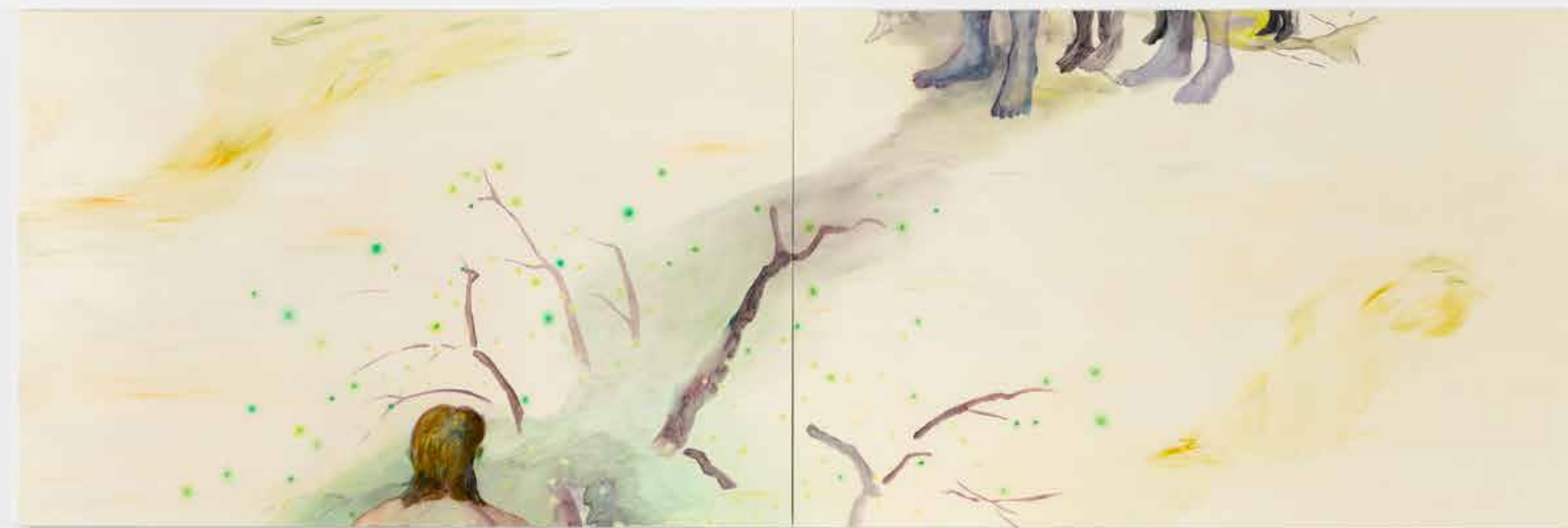
Field (Persimmon Tree Sprout) 2022