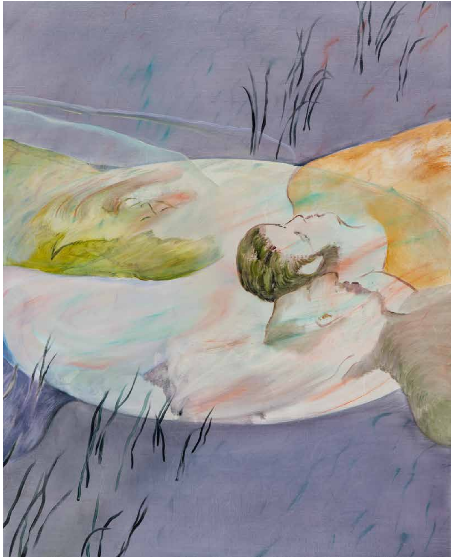
Field (with Grass) 2022