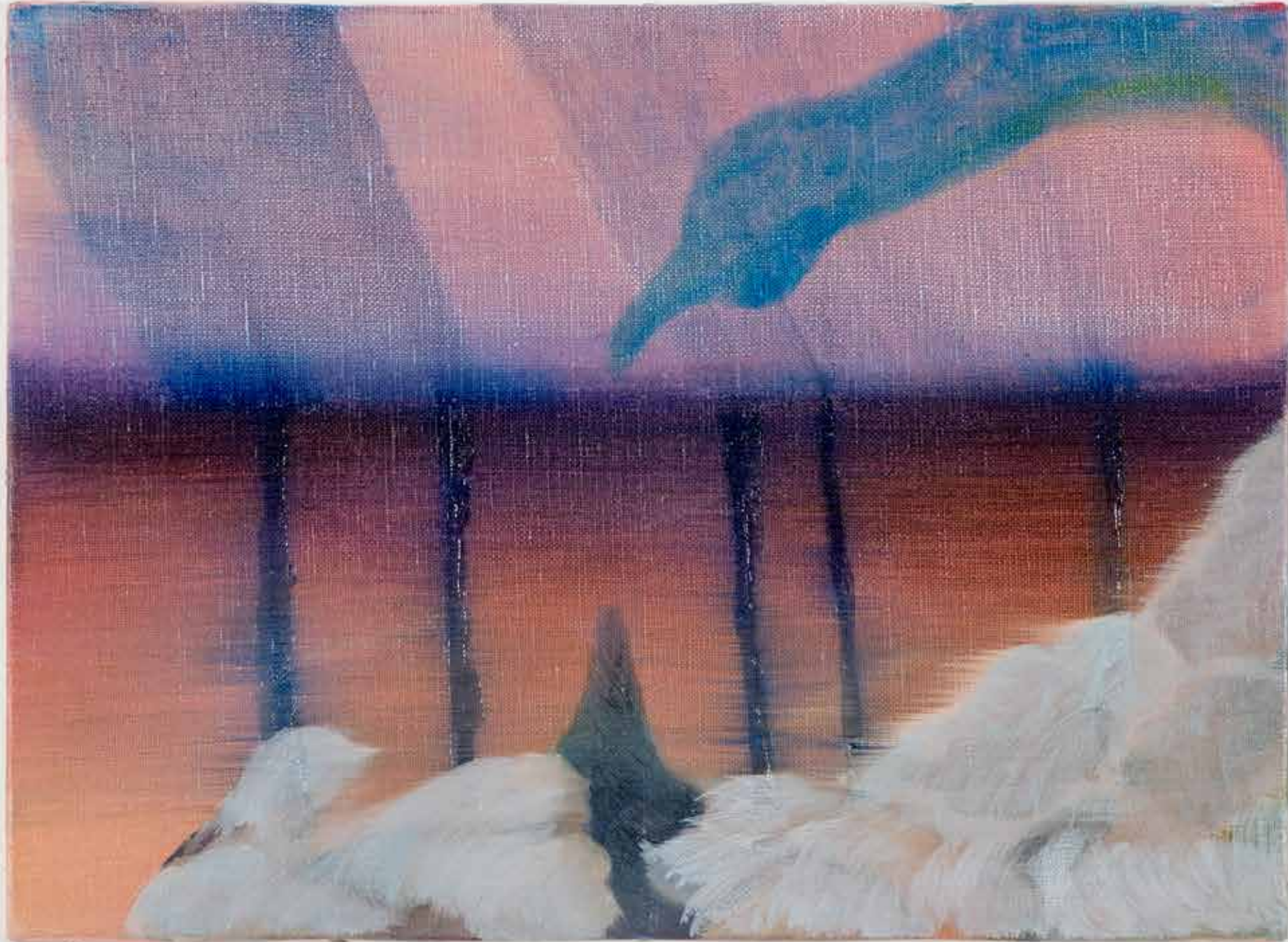
Force (Two Tips) 2022